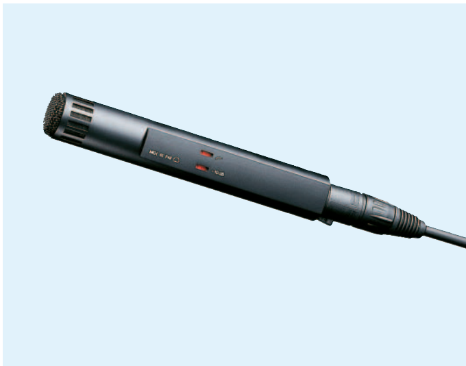
Cable pictured is an accessory not supplied with the microphone

The cardioid MKH 40 has a large number of applications, for example as a main microphone, especially in lightly reverberant or acoustically less perfect rooms, with instrumental groups or for speech applications. Its wide-angled, neutral directional characteristics and high level of reverse attenuation ensure an exceptionally balanced sound.